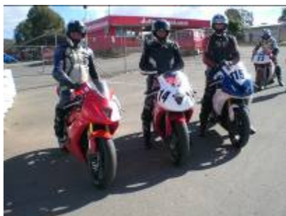
3 Triumphs all in a row!