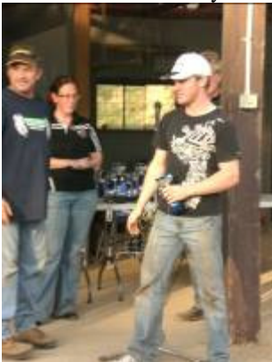
Storm Boy only had time for a photo on the run